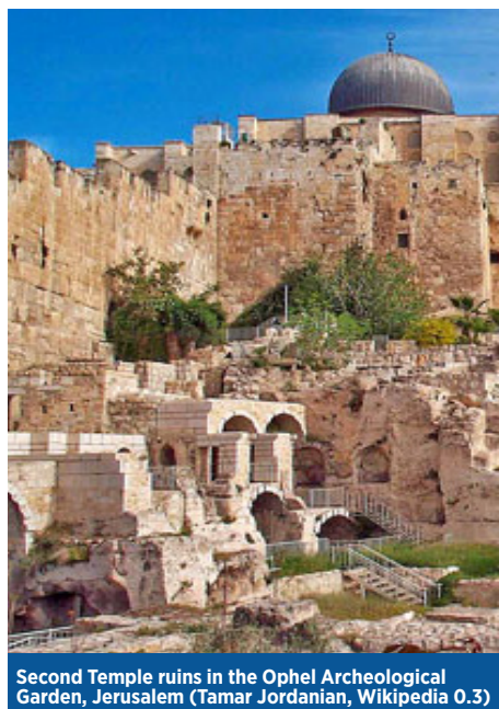
Second Temple ruins in the Ophel Archeological Garden, Jerusalem

There are two reasons why this position is rejected. The first is that other Rishonim (Rashba, Ritva) explain that the independence Rashi refers to is a situation in which Jews live without fear. Sadly, we have not yet arrived at this stage.