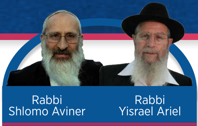
Rabbi Shlomo Aviner