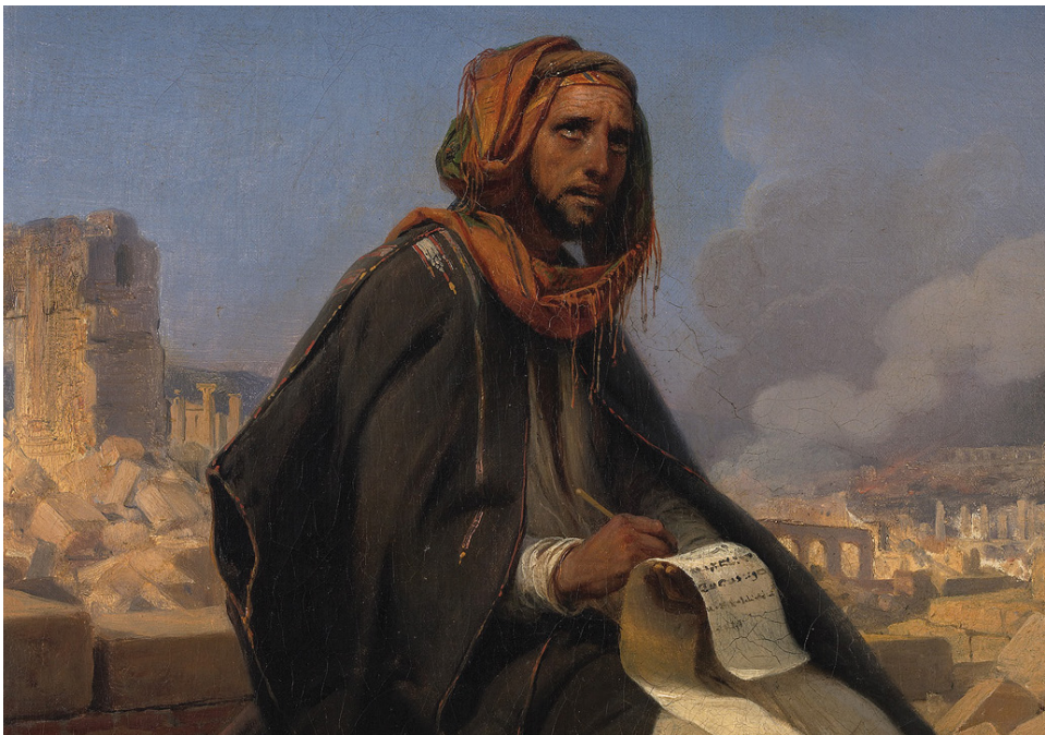
Jeremiah on the ruins of Jerusalem

Then there is linear time: time as an inexorable sequence of cause and effect. As French astronomer Pierre-Simon Laplace said in 1814: If you “know all forces that set nature in motion, and all positions of all items of which nature is composed,” together with all the laws of physics and chemistry, then “nothing would be uncertain and the future just like the past would be present” before