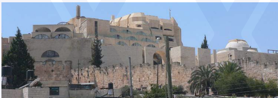
Yeshivat HaKotel

The result of this standoff is that upwardly-mobile young Israeli families have few affordable housing options in Jerusalem, and they have been moving elsewhere. This leaves Jerusalem primarily with a socio-economically poor population – Arabs and