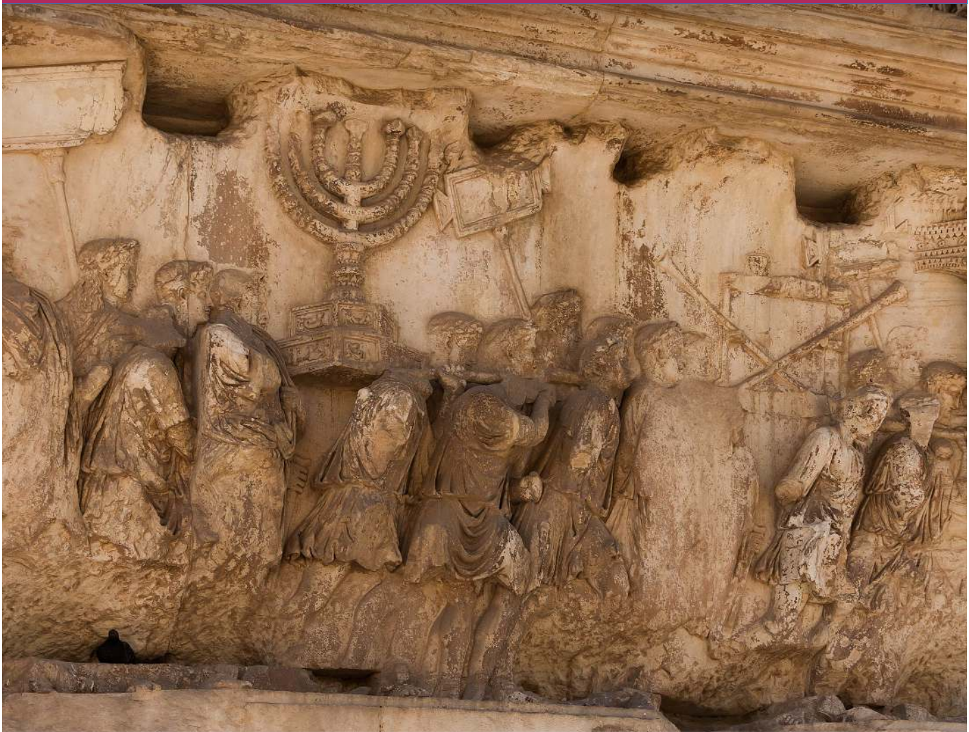
Relief from the Arch of Titus in Rome, showing some of the vessels captured from the Temple

To advertise in HaMizrachi or to dedicate an issue in memory of a loved one or in celebration of a simcha: mizrachi@mizrachi.ca